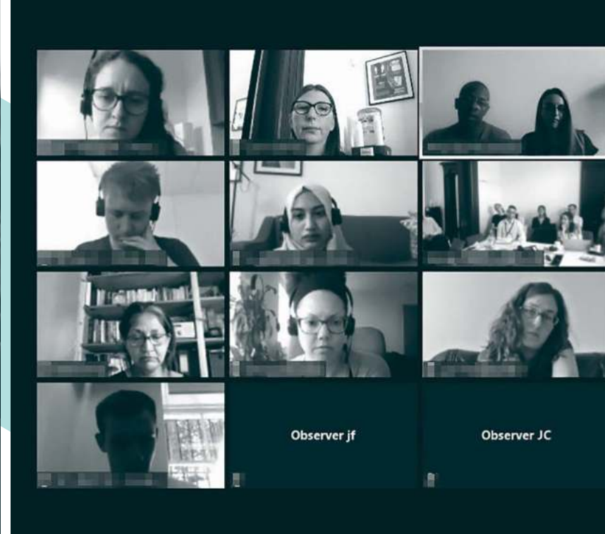
The UK-wide Conversation. Innovations such as Automated Moderation could facilitate genuine mass online deliberation

Groups will be invited to apply for small grants to support them in hosting conversations. The Convention team would produce materials on key democratic issues in a range of interactive formats and guides for groups to facilitate their own conversations.